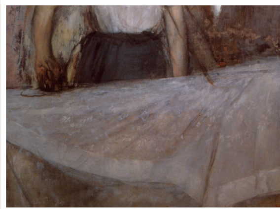
Degas, Detail from Woman Ironing , 1869

The painting on the right was done by Edgar Degas. Degas was the first person to make finished paintings using pastel, which is like a soft chalk. He liked to paint his family and friends doing everyday work. Can you tell that the woman is ironing clothes?