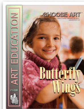
The three programs in Series I

The structural foundation for each program is built around the elements of art : line, shape, color, texture, space, form, and pattern . These seven elements are explored in different ways in each of the programs so that none of the three